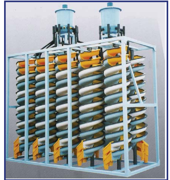
Krebs Mineral Spiral Concentrator

The Krebs Mineral Spiral concentrator is primarily designed to treat pulp streams with a medium heavy mineral content in the range up to 15-80% by weight. It comprises of a backfed feed box, single section helix and a product box. Finger cutters on the helix divert separated minerals into channel areas. Splitters in the product box divide the main trough discharge into concentrate, middlings and tailings with a further option to produce a fourth water peel fraction. The Krebs Mineral Spiral requires little attention during operation and is frequently used where high percentages of dense material is in the feed stage.