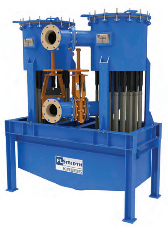
Pod System shown above and Spider Manifold System shown on front cover

solids that do not readily segregate in the pipe are being